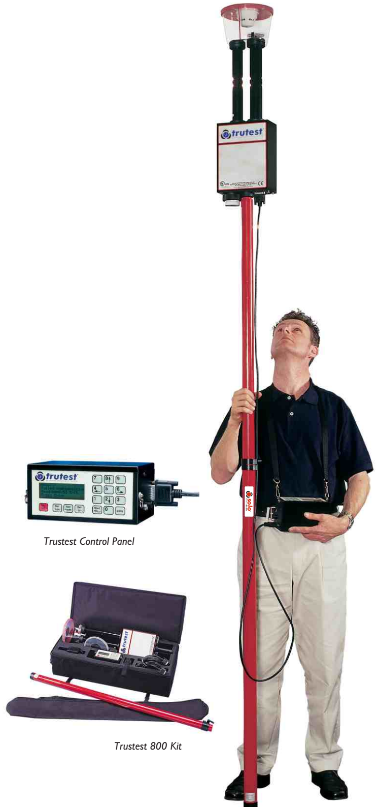
Trutest Control Panel

By introducing a measured and controlled smoke stimulus into the sensing chamber, Trutest enables cross-references to be made between the independent Trutest readings and the analog readings from the system panel. Only in this way can a true test of intelligent systems be achieved.